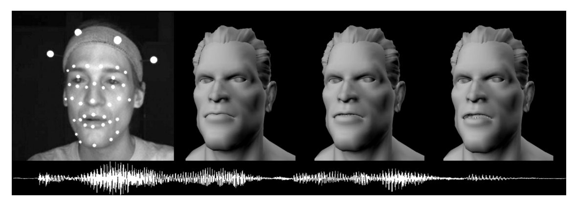
Figure 1: True audio-visual speech synthesis from the same underlying model.